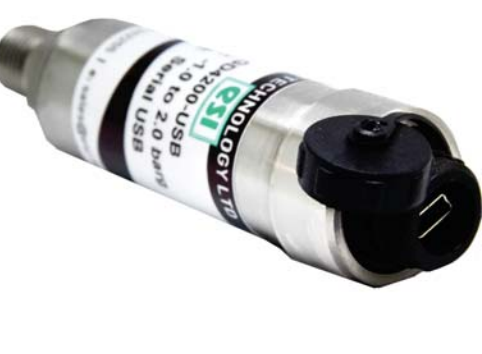
DISCLAIMER: ESI Technology Ltd operates a policy of continuous product development. We reserve the right to change specification without prior notice. All products manufactured by ESI Technology Ltd are calibrated using precision calibration equipment with traceability to international standards.